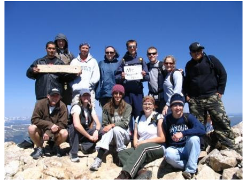
Rams for Christ at 14,000 ft.!

Mondays we'll be having the guys and girls split up for smaller Bible discussions and prayer times on the CSU campus. These are very informal, but are a really important part of our community.